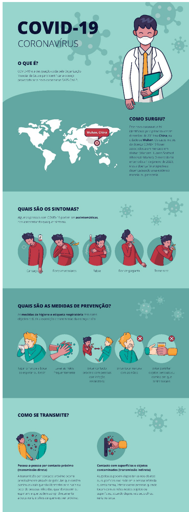
Figure 3 Infographic prototype.